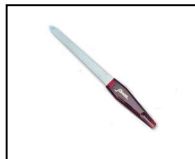
Metal Nail File